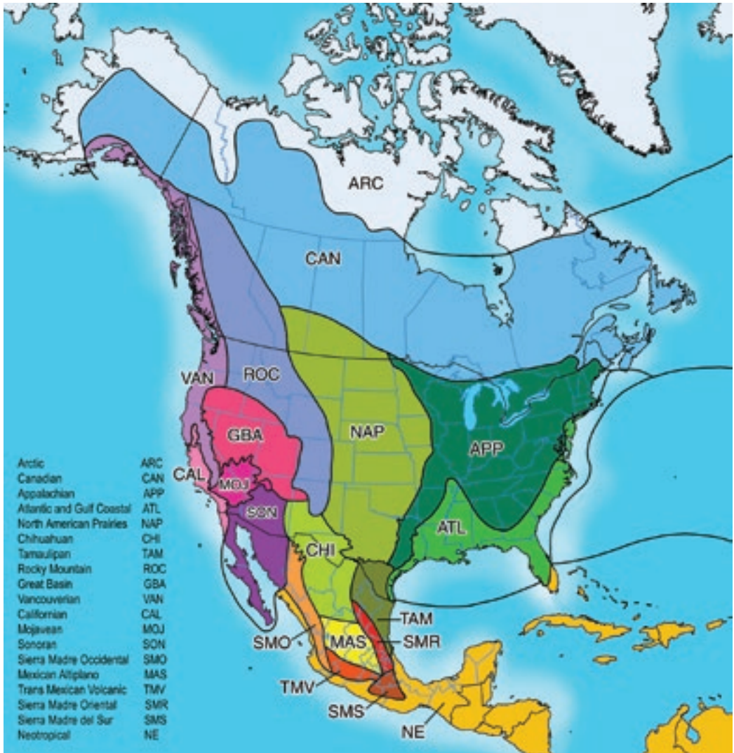
FIG. 1. Floristic provinces/areas of endemism of North America. Regional schema adapted from Takhtajan (1986) as published in Thorne (1993). The areas were drawn in Photoshop by Alice Tangerini on a base map from ArcMap8.2 with a North American Lambert conformal conic projection. The map was published in Katinas et al. (2004) and is used with permission of Missouri Botanical Garden Press and the authors.

spiny hackberry, whereas short, dense brush grows in the shallow, caliche soils. The average annual rainfall is 500 to 800 mm with higher average rainfall as you go west to east. The average monthly rainfall is lowest during winter and highest during spring (May or June) and fall (September). Summer temperatures are high, with very high evaporation rates ( worldwildlife.org/ecoregions/na0303 ; National Climate Data Center, U.S.A. Dept. of Commerce).