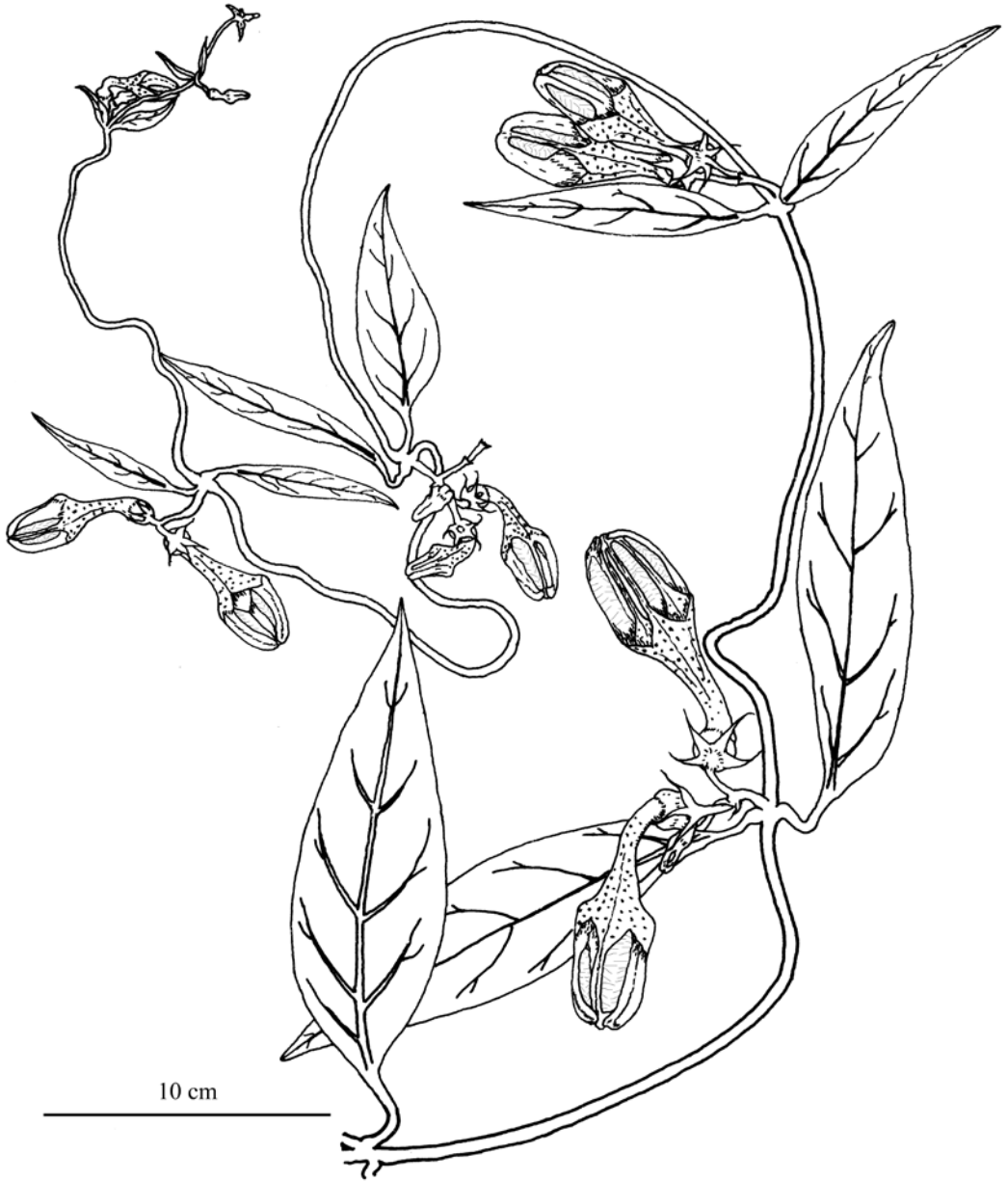
FIG. 3. Line diagram of Ceropegia lucida Wall.

Conservation threat. —The species is threatened by habitat loss due to a number of human activities. These include agricultural expansion, road building and grazing by domestic animals. A number of tourists also visit these areas and owing to its showy flowers, these plants become targets of removal, which is also poses a serious threat to the survival of this species.