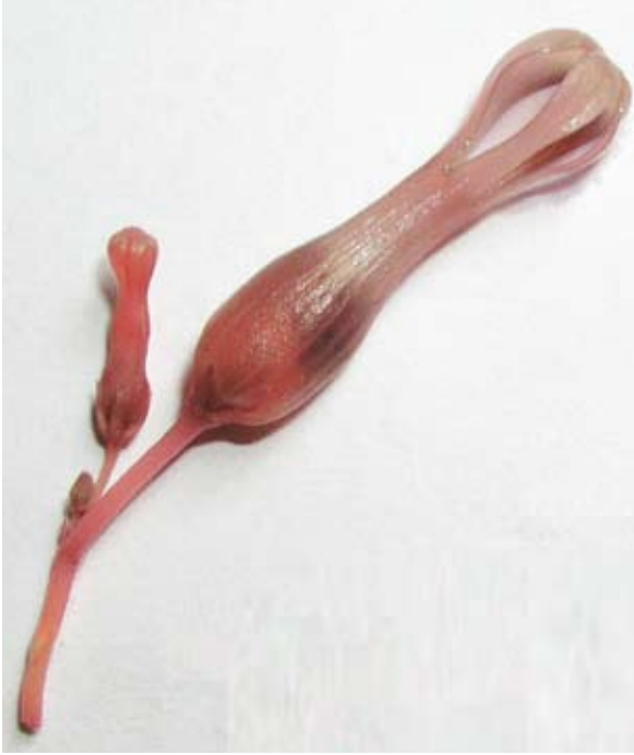
FIG. 4. A flower of Ceropegia hookeri .