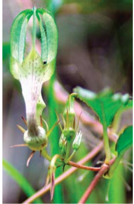
FIG. 5. A plant of C. lucida in its natural habitat. Note its showy flowers; the shape of the flower resembles a fountain from where the genus derives its name.

Long twining, sparsely hairy or glabrous herbs, with tuberous roots. Stem solid, long creeping, up to 2 m long. Leaves membranous, ovate or lanceolate, petiolate, 6.5–10.5 cm long and 1.5–2.5 cm wide; petiole short, 0.5–1.1 cm long. Peduncles short, 1.5–2 cm long, hairy in line. Flowers few (5), in axillary peduncled cymes; pedicels glabrous. Calyx small, about 0.7 cm long; corolla curved, 3.5–4.5 cm long, sparsely dilated at the base, green spotted with purple; upper corolla lobes linear, about 2 cm long, ciliate within the spatulate apex. Outer corona of 5 bifid-deltoid ciliate lobes; inner erect, linear-clavate.