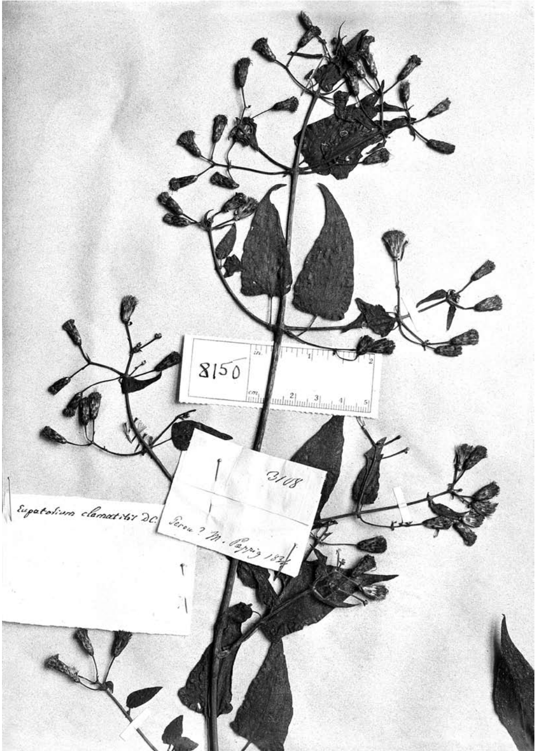
Fig. 2. Photograph of the holotype (Poeppig 3108, G-DC) of Eupatorium dematitidis DC.