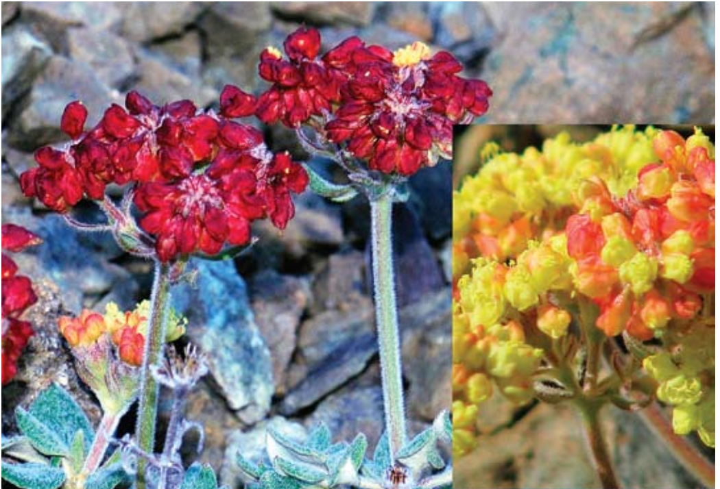
FIG. 2. Eriogonum cedrorum , details of inflorescences.