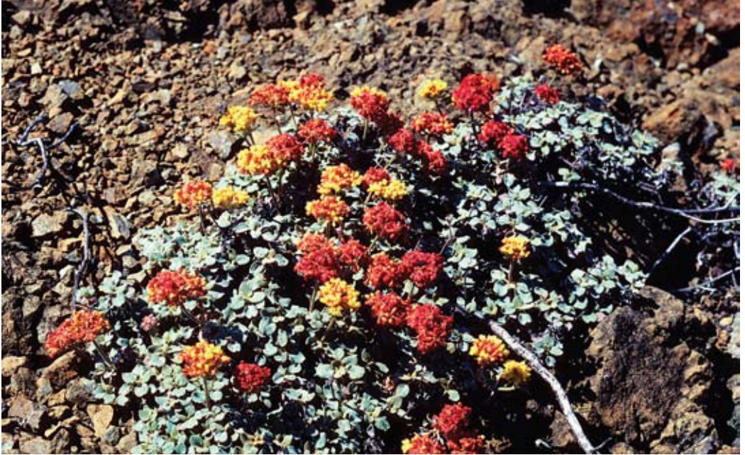
FIG. 1. Eriogonum cedrorum , habit.