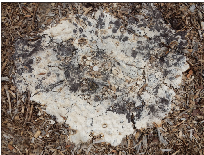
Figure 3. A. World record Fuligo septica aethalium (fruiting body) showing length of 30 in and pancake shape. B. Same specimen showing width of 22 in. C. Same specimen two days later (April 8) with more weathering and exposure of black spore mass and breaking up of cortex (scale = George Washington Head quarter = 1 in).

featured in the science fiction film The Blob released in 1958 starring Steve McQueen in his film debut. This jelly-like blob comes from outer space via a meteorite that falls to earth and then consumes people, getting bigger and bigger until it is finally controlled by freezing and transferring it to the Arctic (Keller and Everhart, 2010).