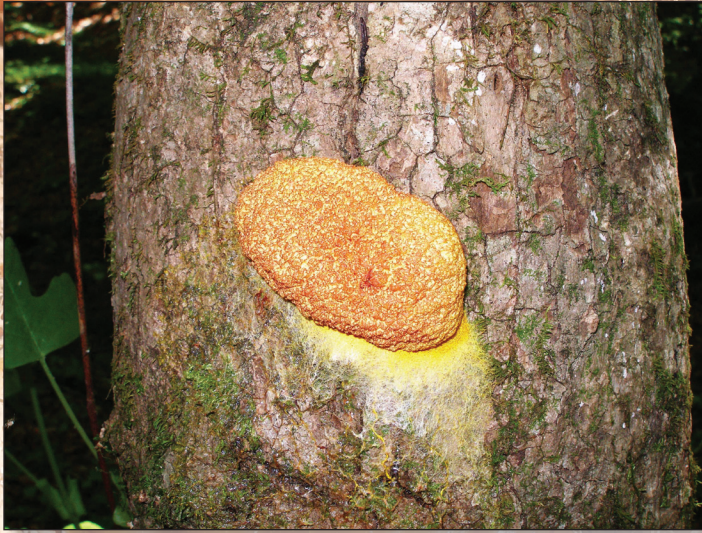
Figure 7. Fuligo septica aethalia that have formed 3 ft above ground level on the bark surface of a living sweetgum tree at a separate site in Great Smoky Mountains National Park. The plasmodium had left a clear trail from ground leaf litter as it migrated up the bark surface.

the spores. This same habitat, such as bark mulch around trees with Fuligo septica aethalia, has been repeated many times in many places (HWK, pers. obs.).