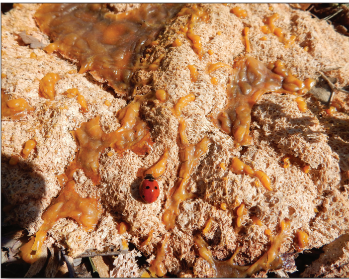
Figure 5. Close-up of prematurely dried aethalium surface showing sclerotized plasmodial remnants and presence of Coccinella septempunctata (the seven-spotted ladybird beetle).

5). No beetles were observed feeding on the plasmodia or exposed spore mass in any of the aethalia.