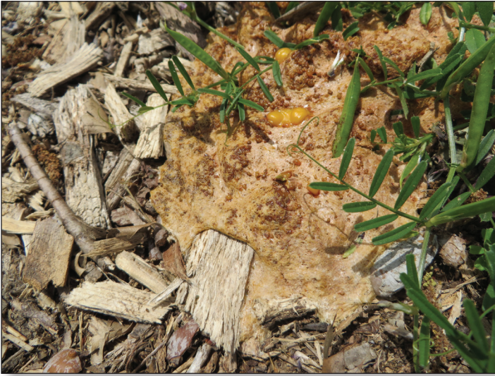
Figure 4. Aethalium with bark mulch fragment, living grass, and portion of yellow plasmodium included in fruiting body formation.