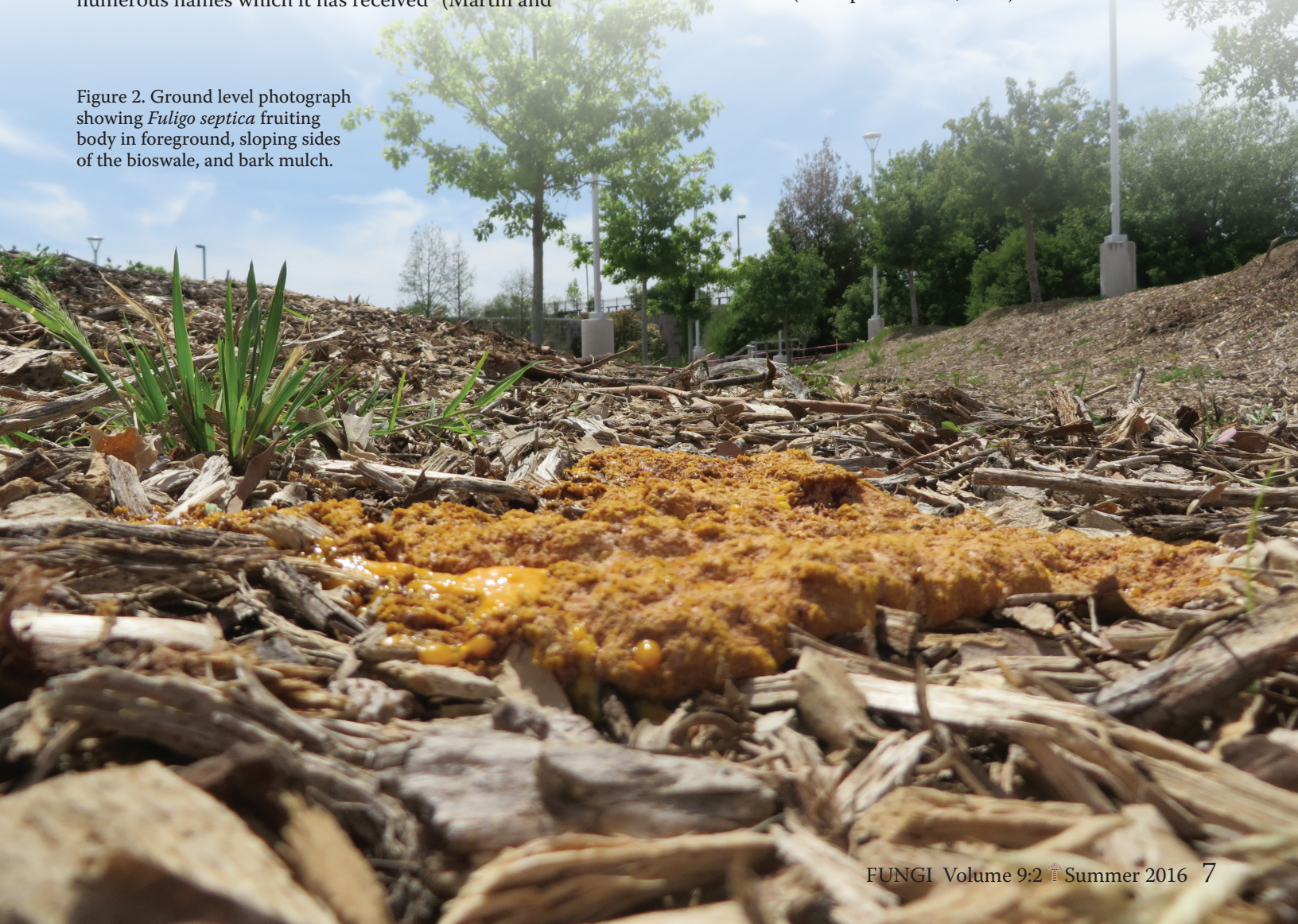
Figure 2. Ground level photograph showing Fuligo septica fruiting body in foreground, sloping sides of the bioswale, and bark mulch.

A large plasmodium thought to be Fuligo septica discovered growing in a yard in Garland, Texas, USA, made headlines in a Dallas, Texas, newspaper as the “Texas Blob,” and the homeowner was horrified that a mutant bacterium would take over the earth (Alexopoulos et al., 1996). The same theme was